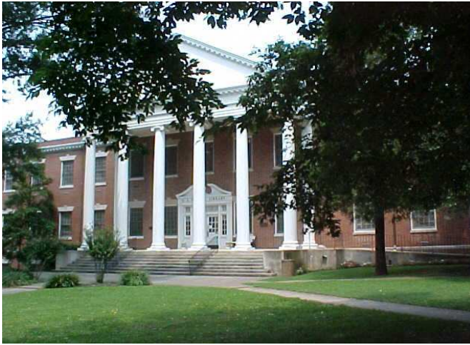
Luther L. Gobbel Library, Lambuth University, Jackson, Tennessee