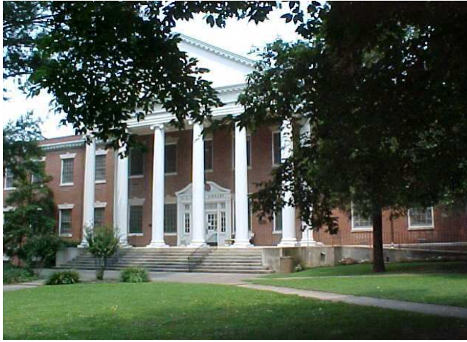
Luther L. Gobbel Library, Lambuth University, Jackson, Tennessee